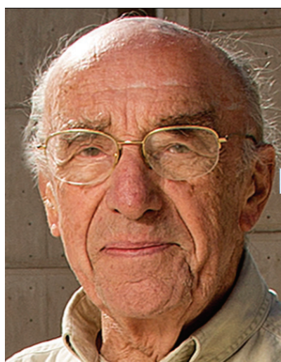
Fig 1. R. Guillemin at the age of 90

These studies were incredibly painstaking and lengthy, without much hope of success. Suffice it to say that in four years (1964-1967) in Houston,