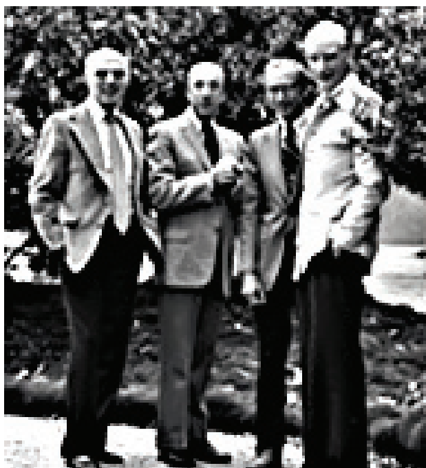
Fig. 3. Four Nobel Prize laureates in physiology or medicine (from left to right; years of award in brackets) at one conference: R. Dulbecco (1975), R. Guillemin (1977), R. Holley (1968) and F. Crick (1962)

more than 5 million pieces (50 tons) of sheep hypothalamus had to be collected, and the purification and determination of the chemical structure of the first neurohormone thyrotropin-releasing factor (TRF) took seven years and was successfully completed in 1969. Subsequently, R. Guillemin calculated that 1 kg of purified TRF cost 2.5 times more than the same weight of soil delivered from the Moon. This success led to the isolation of somatotropin (growth hormone), the identification of the thyrotropin-releasing hormone (TRH) molecule, thyrotropin-releasing hormone, which controls all functions of the thyroid gland. The use of the radioimmunoassay method developed by R. Yalow played a huge role in further work. Later, R. Guillemin and E. Schally (both received American citizenship in the 1960s) and their colleagues isolated other molecules from the hypothalamus (now many dozens of them are known) that control all functions of the pituitary gland, for example, gonadotropin-releasing hormone (GnRH) – A hormone from the hypothalamus that causes the pituitary gland to release gonadotropins, causing the release of hormones from the testes or ovaries. This discovery led to advances in the treatment of infertility and prostate cancer. It became clear that the human brain is the most important gland of the body.